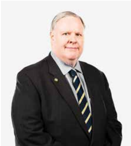
Rep. Philip S. English Co-Chair, Government Relations Practice

The midterm election leaves neither party with a political mandate or firm domination over either chamber in Congress. In a polarized political system with a shrinking ideological center, the primary likely outcome involves concentration on less divisive issues.