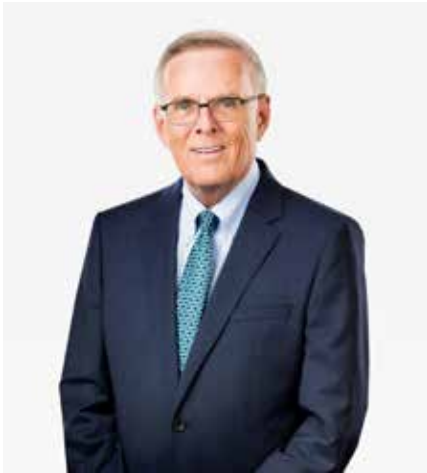
Sen. Byron L. Dorgan Co-Chair, Government Relations Practice

The two political parties will no doubt continue to have difficulty agreeing on some major issues. But that doesn't mean there won't be any opportunities to advance legislation on important matters. Even as the parties battle over some big issues, the Congress will still have to enact appropriation and authorization legislation and that always provides opportunities for legislative accomplishments. In addition, there will be other deadlines (debt ceiling and more) that will require the Congress to act. When they act, there is an opportunity to write new or improve existing legislation on many issues. So, there will be talk about "gridlock," but even in that climate, there are opportunities to get things done. Fixing bad legislation, improving existing legislation, and writing new legislation ... all of these actions are possible, even when the political parties don't get along. But it requires skilled strategy and advice from those who know how the system works and how to get things done during a challenging time. That is what our Government Relations Practice is able to do for our clients.